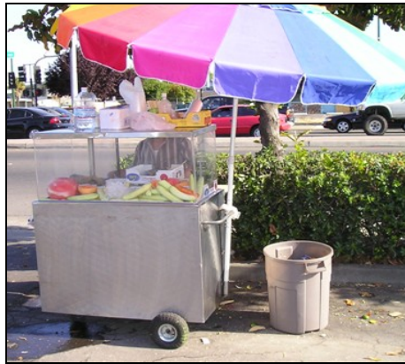
Unpermitted Food Vendor