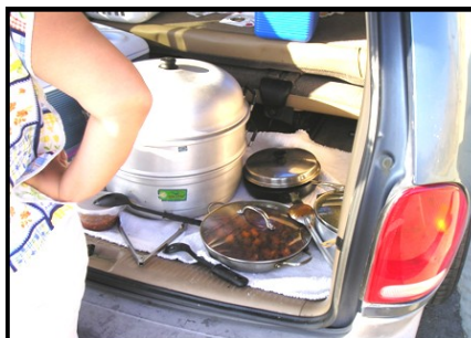
Unpermitted Food Vendor Selling Out of a Car